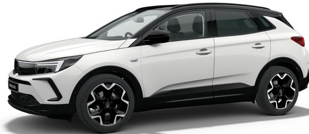
Grandland Ultimate JO.tiff