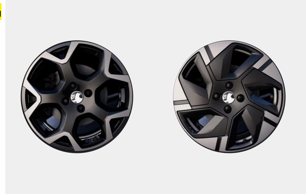
18-inch black diamond cut alloy wheels (standard on petrol only, no cost option on electric)