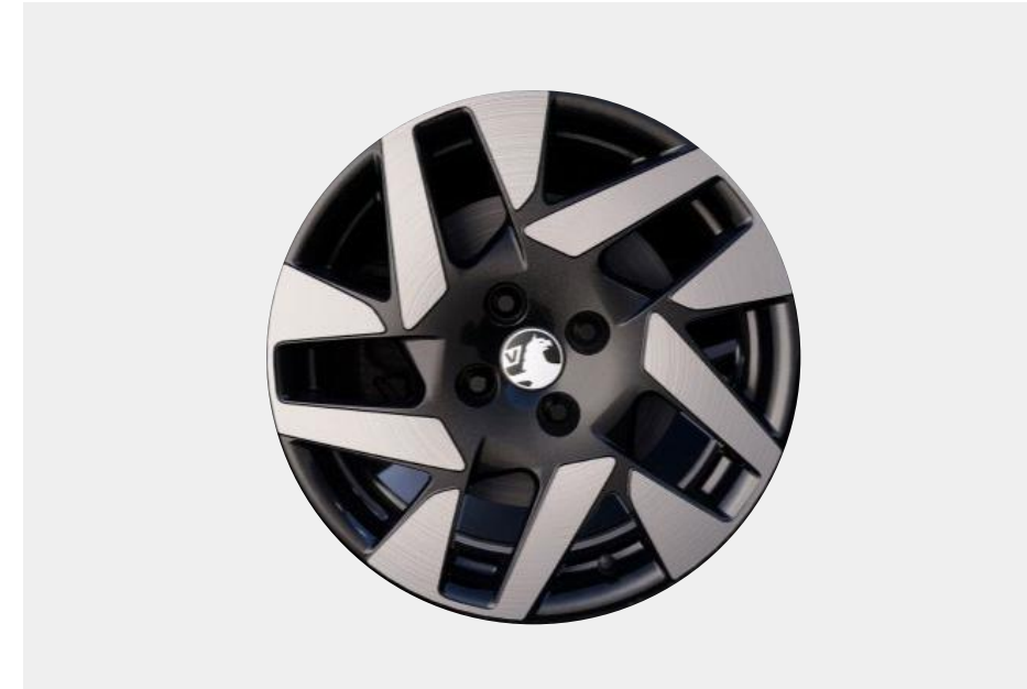
17-inch alloy wheel.