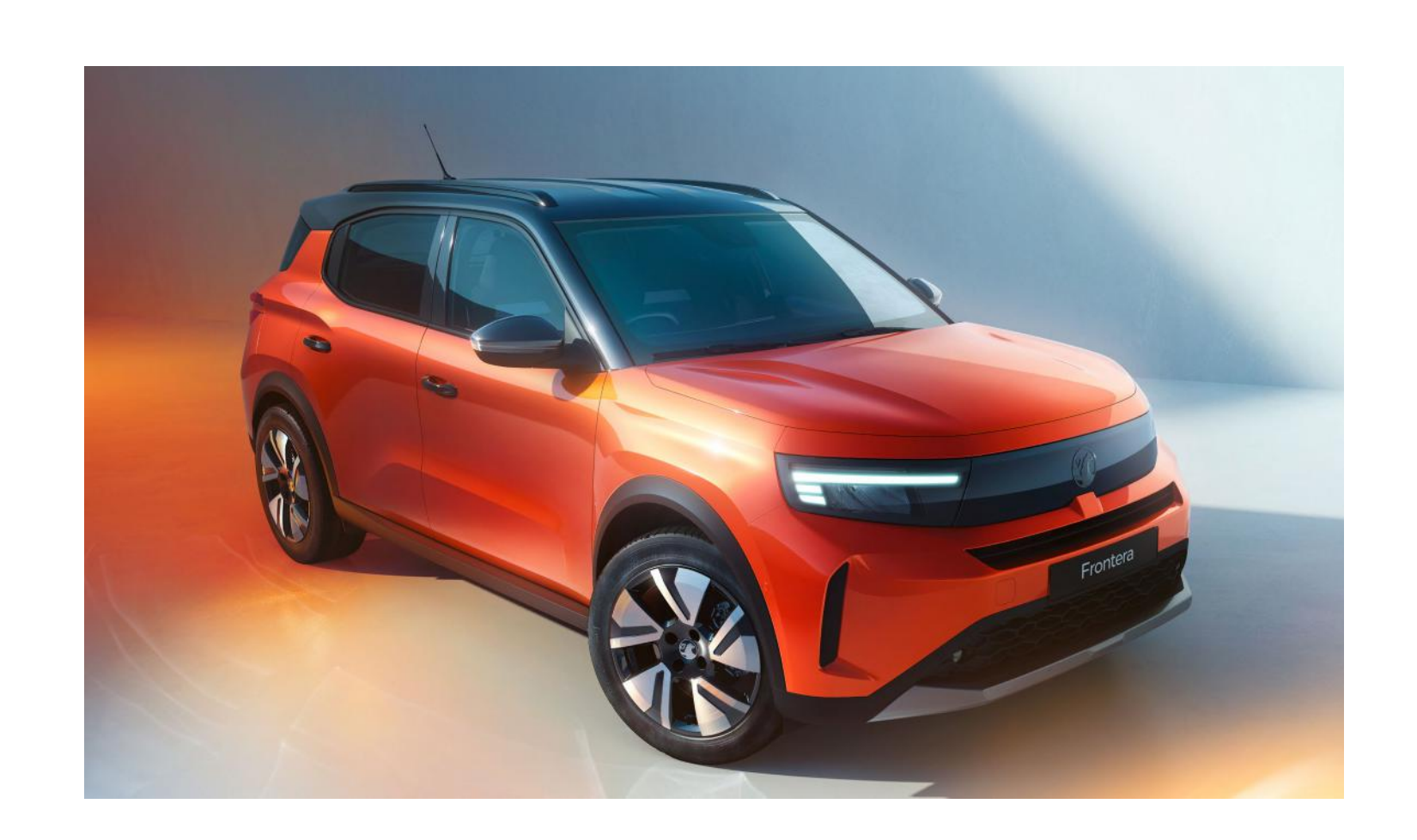
Canyon Orange - Gloss Metallic Paint